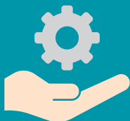
High Touch Service