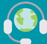
Global Support Team